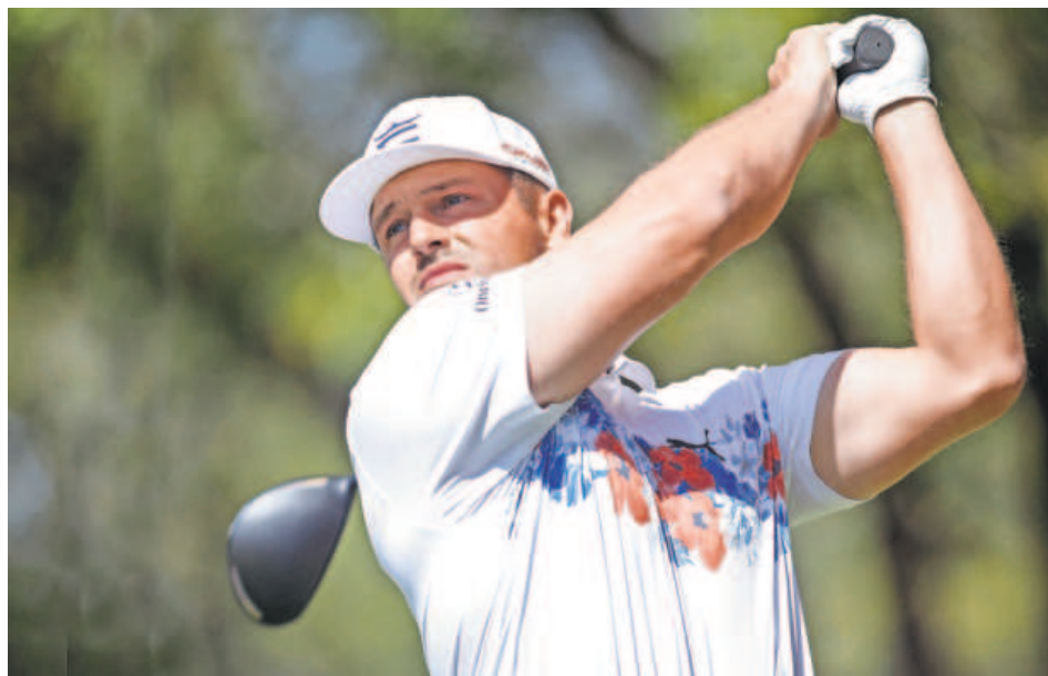
Bryson DeChambeau tees it up Wednesday for the first time on the PGA Tour since late January.

Having last played at the Farmers Insurance Open in late January, DeChambeau told Golf Channel on Tuesday he had no expectations heading into the week, one in which he returned from a hand injury. The eight-time PGA Tour champ said he hadn't started working with his driver until last weekend and added he may need surgery, a problem