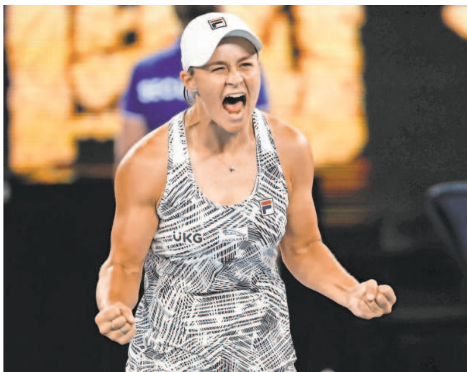
Ashleigh Barty celebrates after defeating Danielle Collins for the Australian Open title.

Among all the professional sports in the world, tennis is arguably the most grueling lifestyle. Many of the top players, especially women, are professionals by their mid-teens. To make it big usually requires years of scratching and clawing through minor tournaments and qualifying events into the big ones so that eventually you can get a ranking high enough to pick and choose where